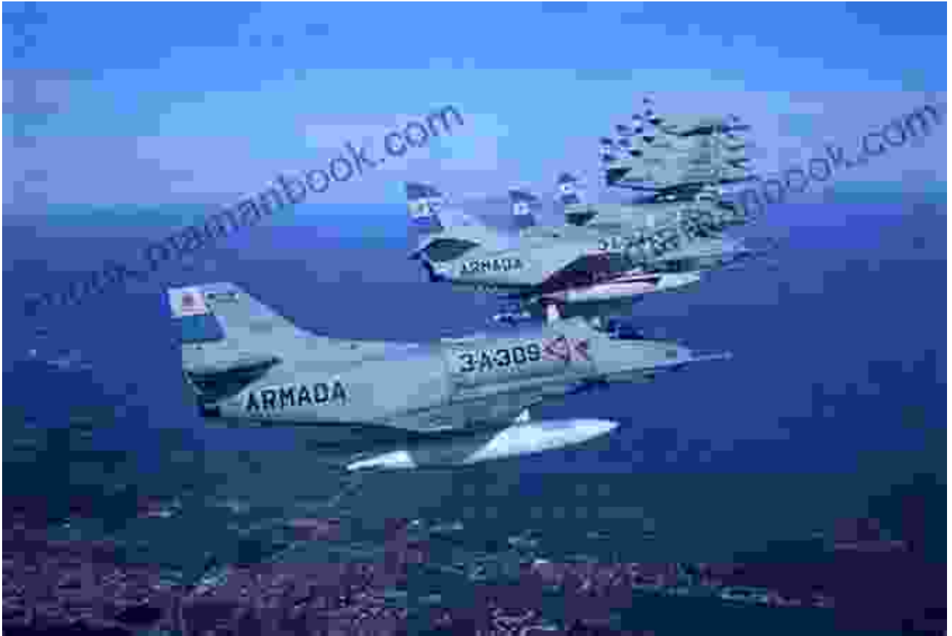
A Sea Harrier engages in air combat with an Argentine A-4 Skyhawk