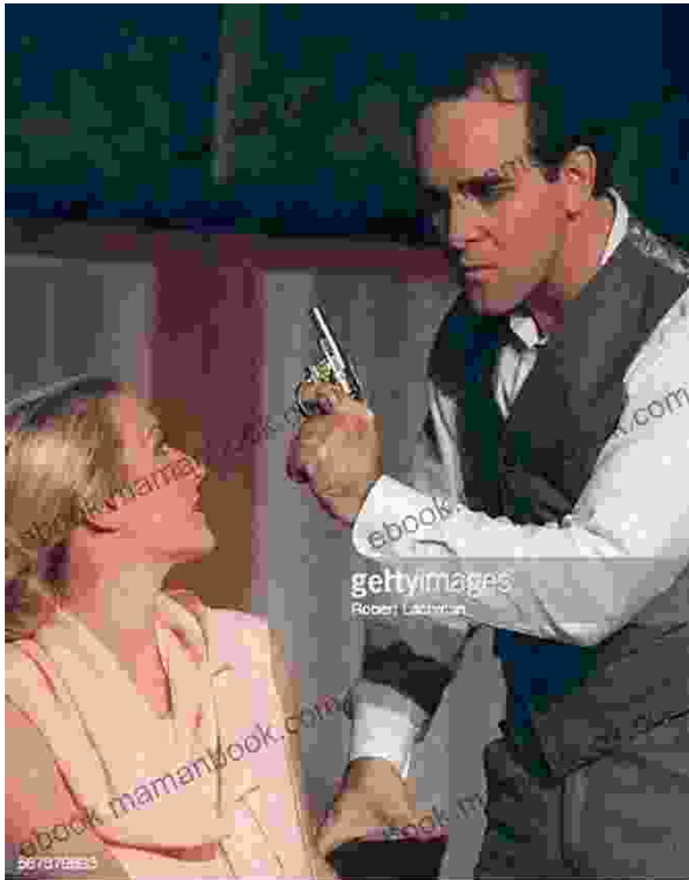
A scene from the play Post Mortem

This collection of four classic plays by Noël Coward is a must-read for any fan of theater. These witty and sophisticated comedies explore the themes of love, marriage, and social class with wit and charm. They are sure to entertain and delight readers of all ages.