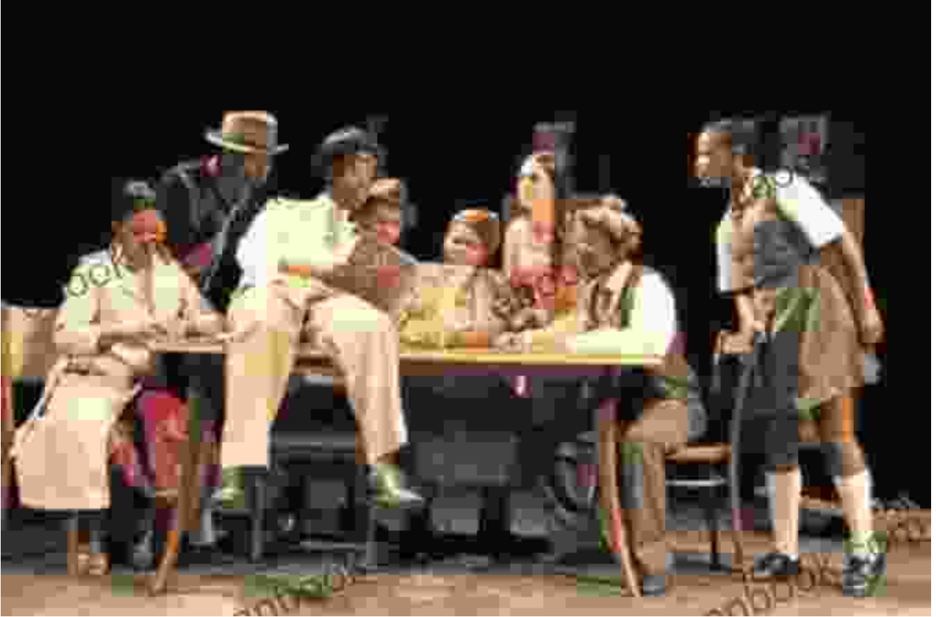
A scene from the play Bitter Sweet